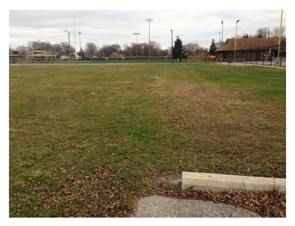
<u>Photo B3: Former Riverside Arena Site – View southerly from Cenotaph location</u>