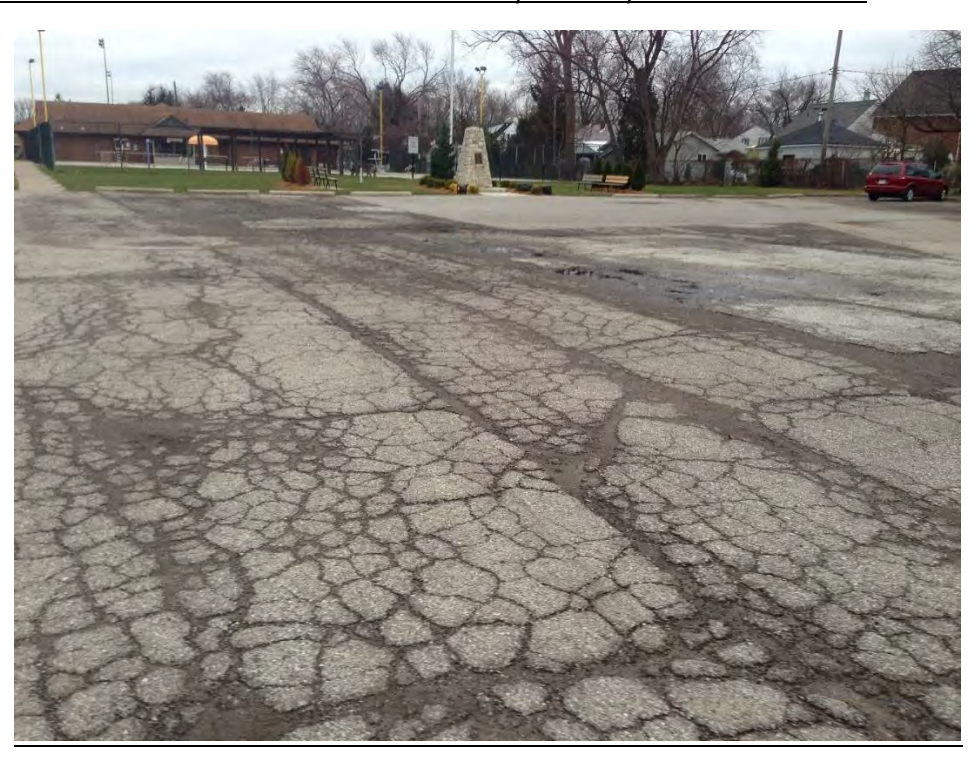
Photo B2: Former Riverside Arena Site – View of Cenotaph & Centennial Pool