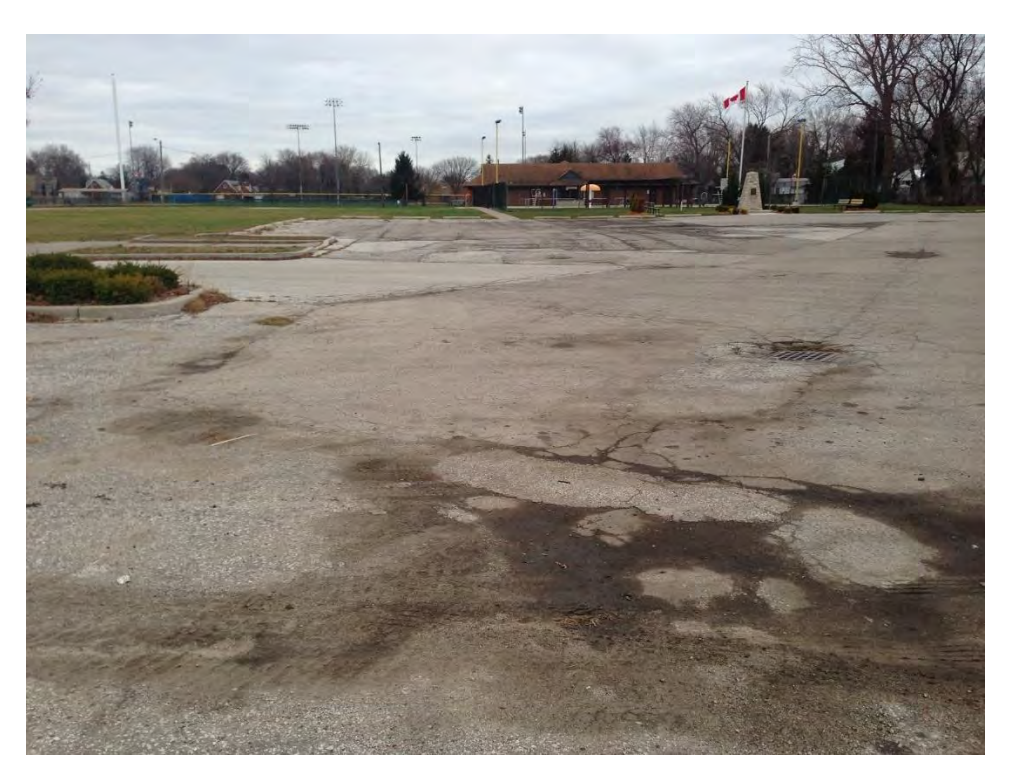
Photo B1: Former Riverside Arena Site – View southerly from Wyandotte Street East