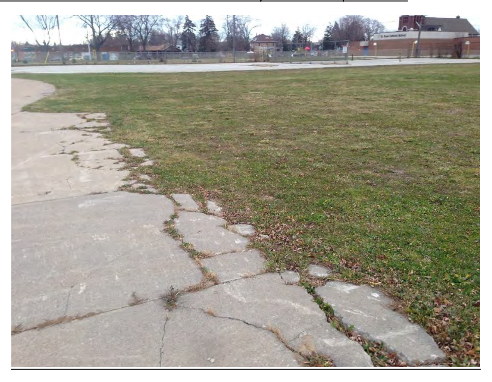
<u>Photo B4: Former Riverside Arena Site – View of easterly from Cenotaph location</u>